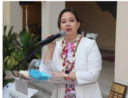
U.S. Representative Jill Tokuda reads remarks by U.S. Senato. Mazie K. Hirono

To see more photos of the event go to: thelegalclinicahawaii.org/updates-events/